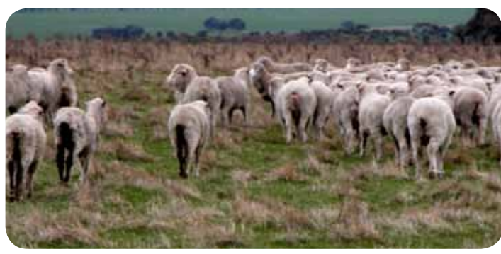
(The distinct 'tail' of an OJD flock.)